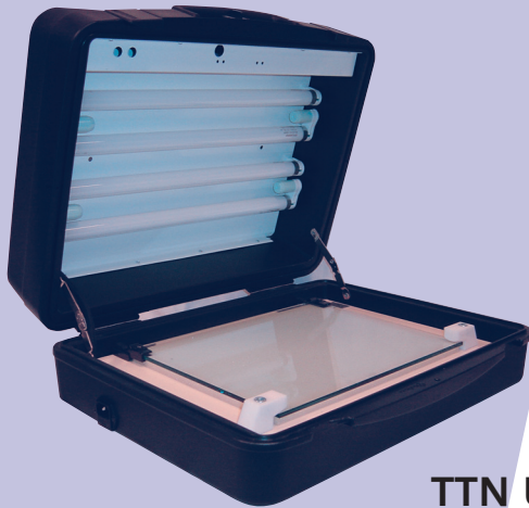
TTN UV MARK

T a m p o T e c h n i e k N e d e r l a n d B V