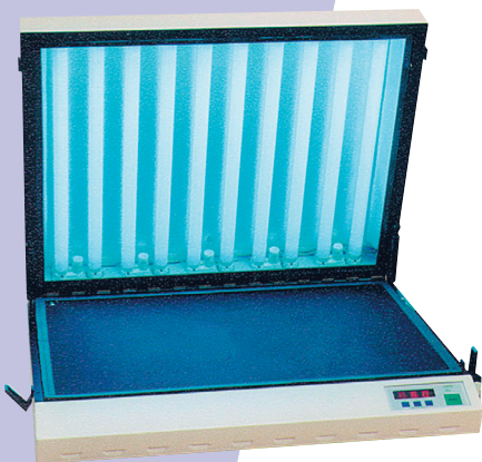
TTN AY 360