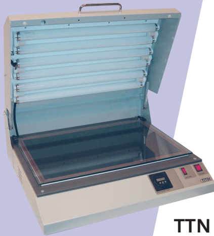
TTN MARK GF